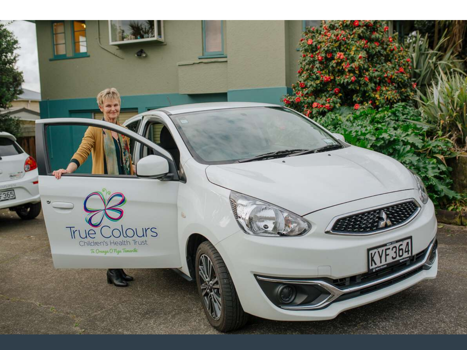
Helping Courage Shine Through