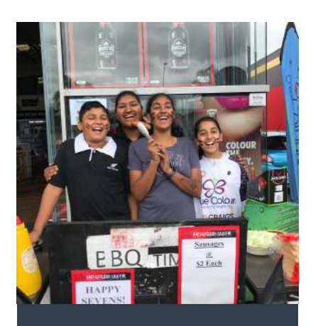
The Kansal family who own Smugglers Liquor hold a sausage sizzle every weekend to raise money for True Colours. All those sauages raised $1600!