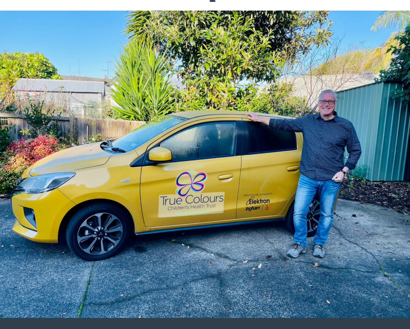
Helping Courage Shine Through